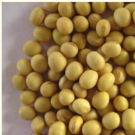
The Soy beans

endowments man is blessed with, the soy seed has come to symbolise a whole lot. To the discerning mind, soy seed literarily depicts power, freedom from want and hunger, and wait