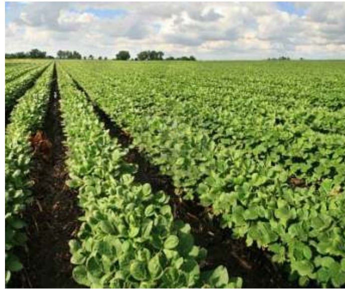
A Soy Farmland

Sunday Independent in Makurdi said, "The death of Taraku Mills killed Soybeans business for Benue farmers. Many of us, like me have gone into orange and mango farming for export to countries like Cameroon, Chad and Niger. But it is unfortunate because we were making some good fortunes until things became bad with the Taraku milling factory."