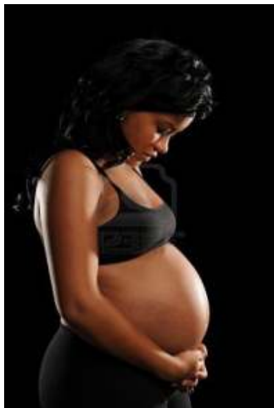
Nutritional supplementation required for a healthy pregnancy

Ensure that all health workers provide appropriate counseling for malaria prevention, treatment and control; and