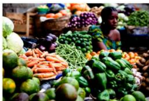
fruits and vegetables essential for daily consumption

They may even reduce the risk of certain other cancers, such as breast, bladder, pancreas, and larynx cancers.