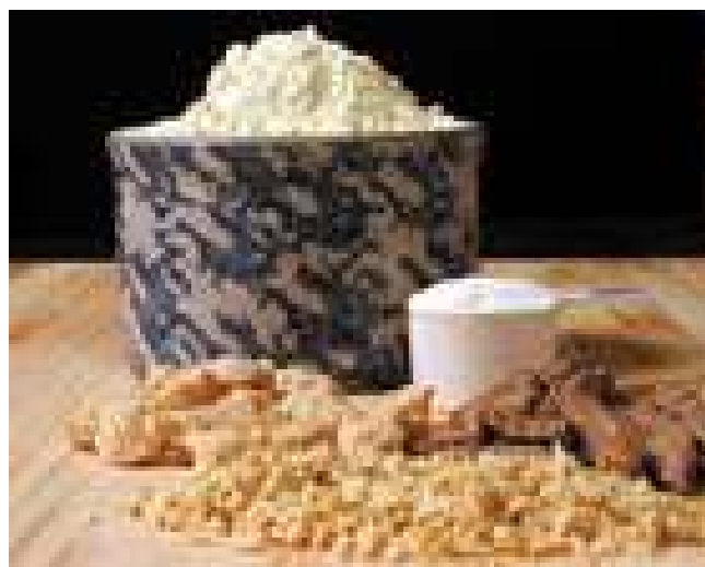
Soy flour, used for baking

"Developing countries are driving protein demand as the global population grows. Raising low-income consumers out of poverty is the most important factor in future global demand for food, and WISHH has the strategic plan to help them at the same time we expand the U.S. soy market."