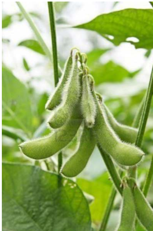
A Soy plant

soybeans for which he said Benue could tap into with benefits.